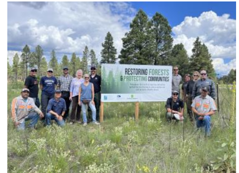
GFFP Partner Field Tour at the NAH Project.

The NAH Project is located within Flagstaff's Wildland Urban Interface (WUI) and compliments several nearby treatments and reduces wildfire risk for many adjacent or nearby valued assets. The values at risk included Flagstaff's westside business district, Flagstaff Pulliam Airport, Fort Tuthill County Park, Flagstaff Urban Trail System (FUTS), several neighborhoods, and major highways including State Route 89A/Beulah Boulevard and Interstate 17. In addition, the project added to landscape level fire resilience for the nearby Coconino National Forest's Southside Airport Project and the Fort Tuthill County Park Project (WFHF grant awarded to GFFP and Coconino County in 2018). To fulfill another project objective that included supporting local forest product industry,